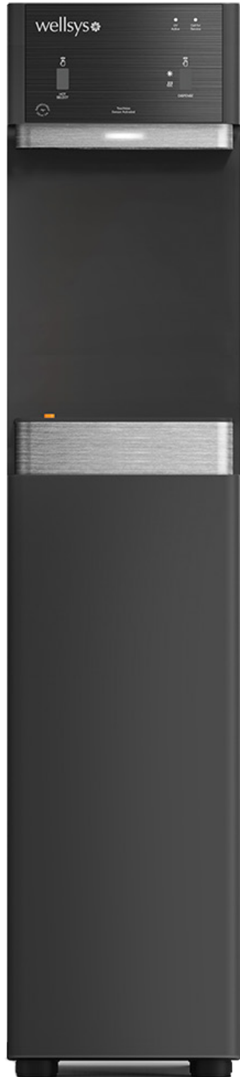
Manufactured in Korea