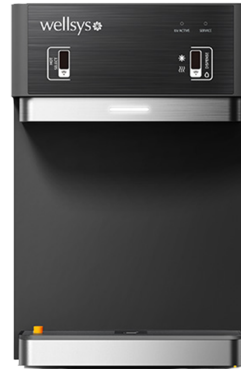
Manufactured in Korea